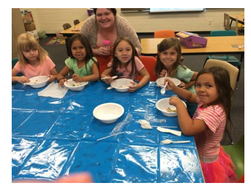
K-2<sup>nd</sup> grade students beating the heat with some ice cream that they made from scratch.